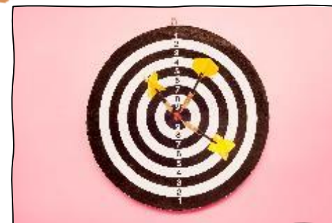
“Self-evaluate your language