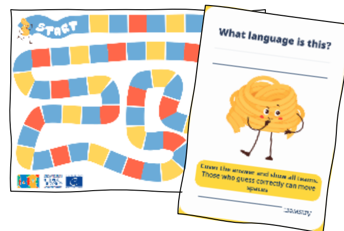
Language board game “Linguine”