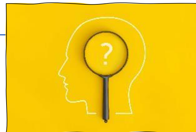
Po11 on 1anguages